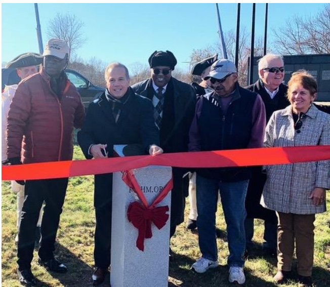
Installation of the Slave History Medallion at Patriot’s Park in Portsmouth, RI